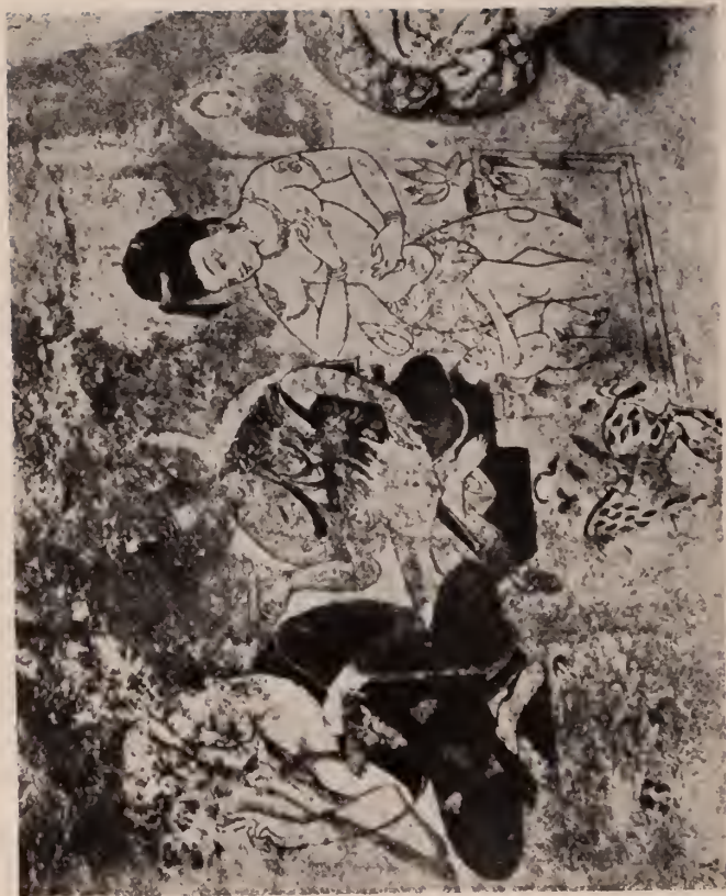
FRESCO FROM DANDAN ULJO, KHOTAN (EIGHTH CENTURY). FROM "ANCIENT KHOTAN," BY STEIN.